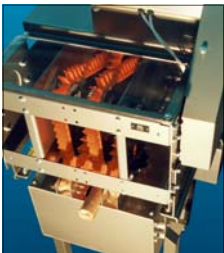
CUSTOM METERING BELTS Including Finned Belt for fragile products and O-head Mat Top for Pouch/Bars